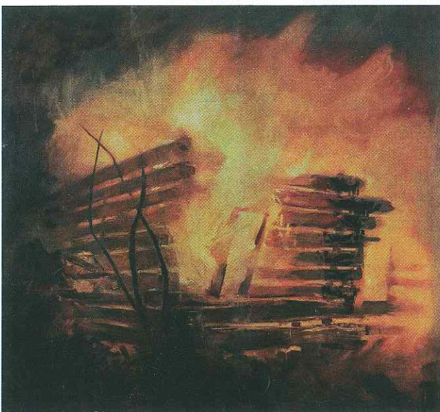
Sacrifice , Richard Neal

For more information about the exhibit and the Cape Cod Museum of Art, go to CCMoA.org/fragile